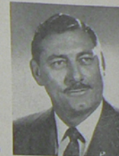
SOUTHERN ARIZONA CHAPTER