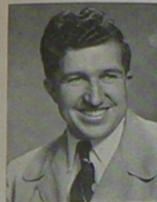
CENTRAL ARIZONA CHAPTER