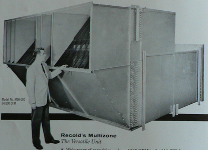
Model No. MZH-580 34,000 CFM