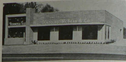
Our conveniently-located and modern showroom and warehouse has displays of all architectural products.

ARCHITECTURAL DIVISION GLADDING, McBEAN & CO. 1348 EAST CAMELBACK ROAD • PHOENIX • CRestwood 4-5361